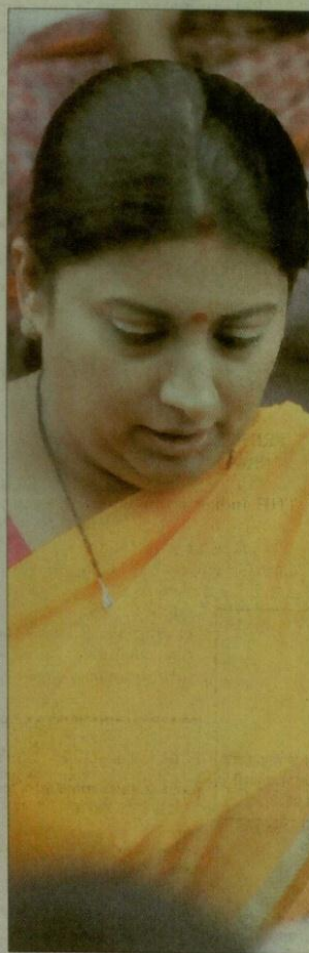
Smriti Irani at the Parliament House in New Delhi on Wednesday.