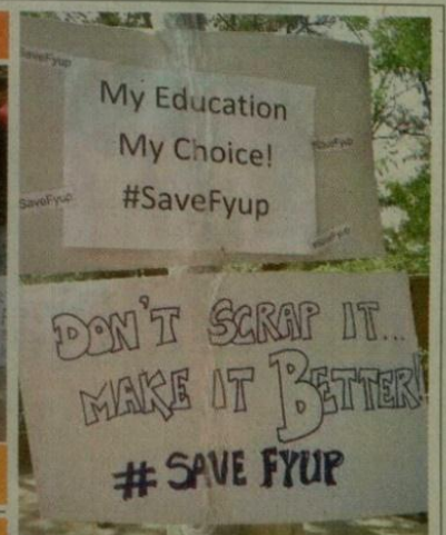
Slogans were shouted and protests were organised in Delhi University on Wednesday

against Vice-Chancellor (VC) and DU administration outside Union Human Resource Development Minister Smriti Irani's house on Wednesday.