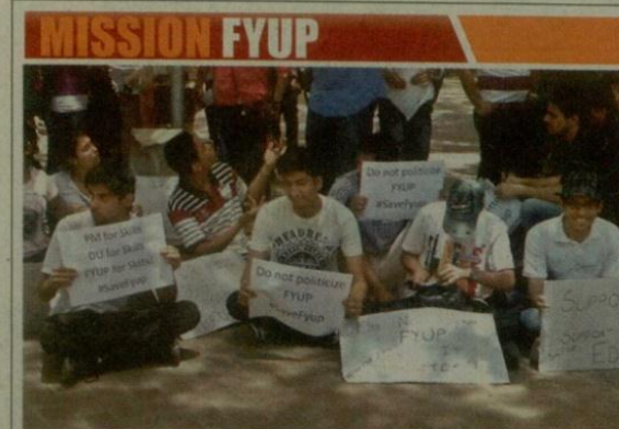
■ A group of around 200 first-year students from various colleges of the university staged a demonstration in favour of FYUP